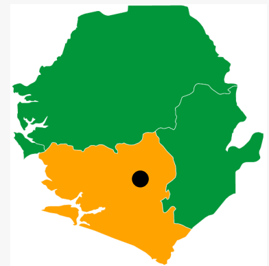
Mobility Sierra Leone training centre is based in Bo, the capital of Sierra Leone

Project duration July 2017 – July 2018 Project evaluation November 2018